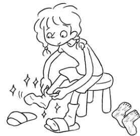
change my socks