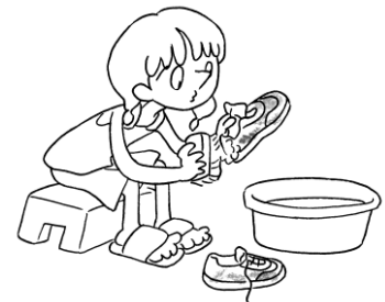
wash my sports shoes