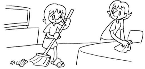
help with the housework