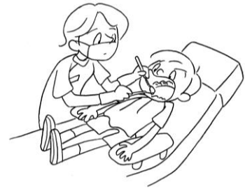
go to the dentist