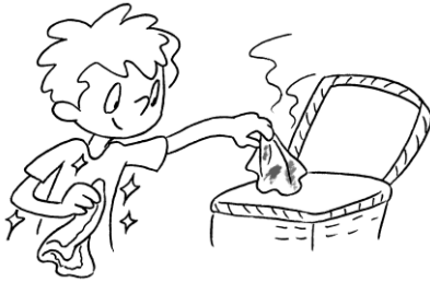
change my facecloth