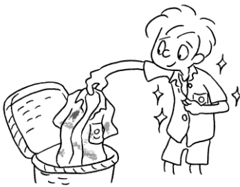
change my uniform